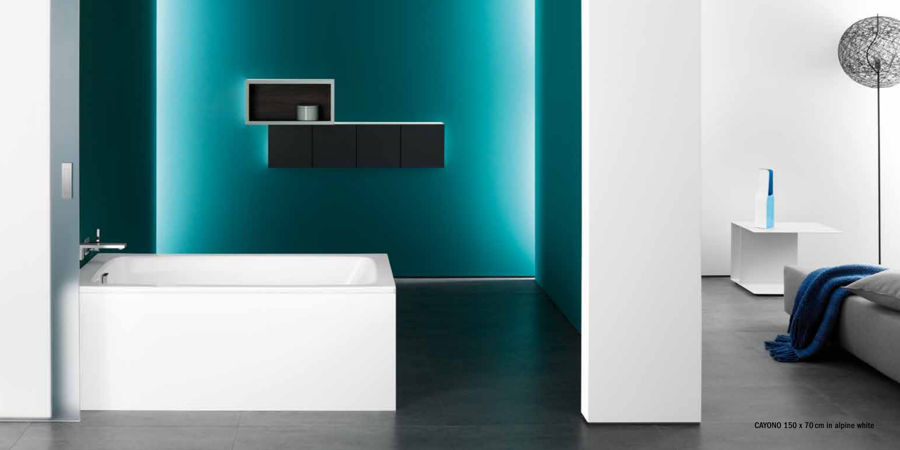
CAYONO 150 x 70 cm in alpine white